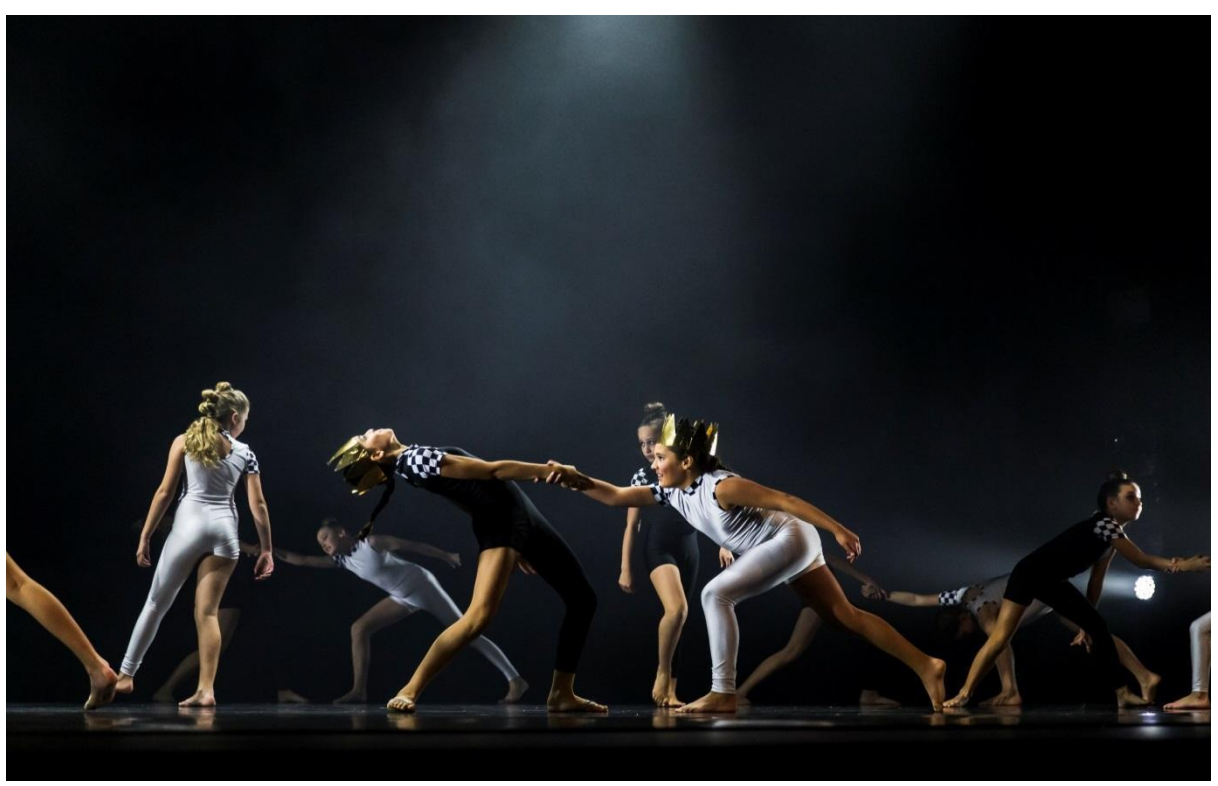
Randwick Public School

For time efficiency there is an Application Checklist found below. To ensure you are able to complete your application properly and all in one go, please make sure you have the information contained in the checklist available before completing your application.