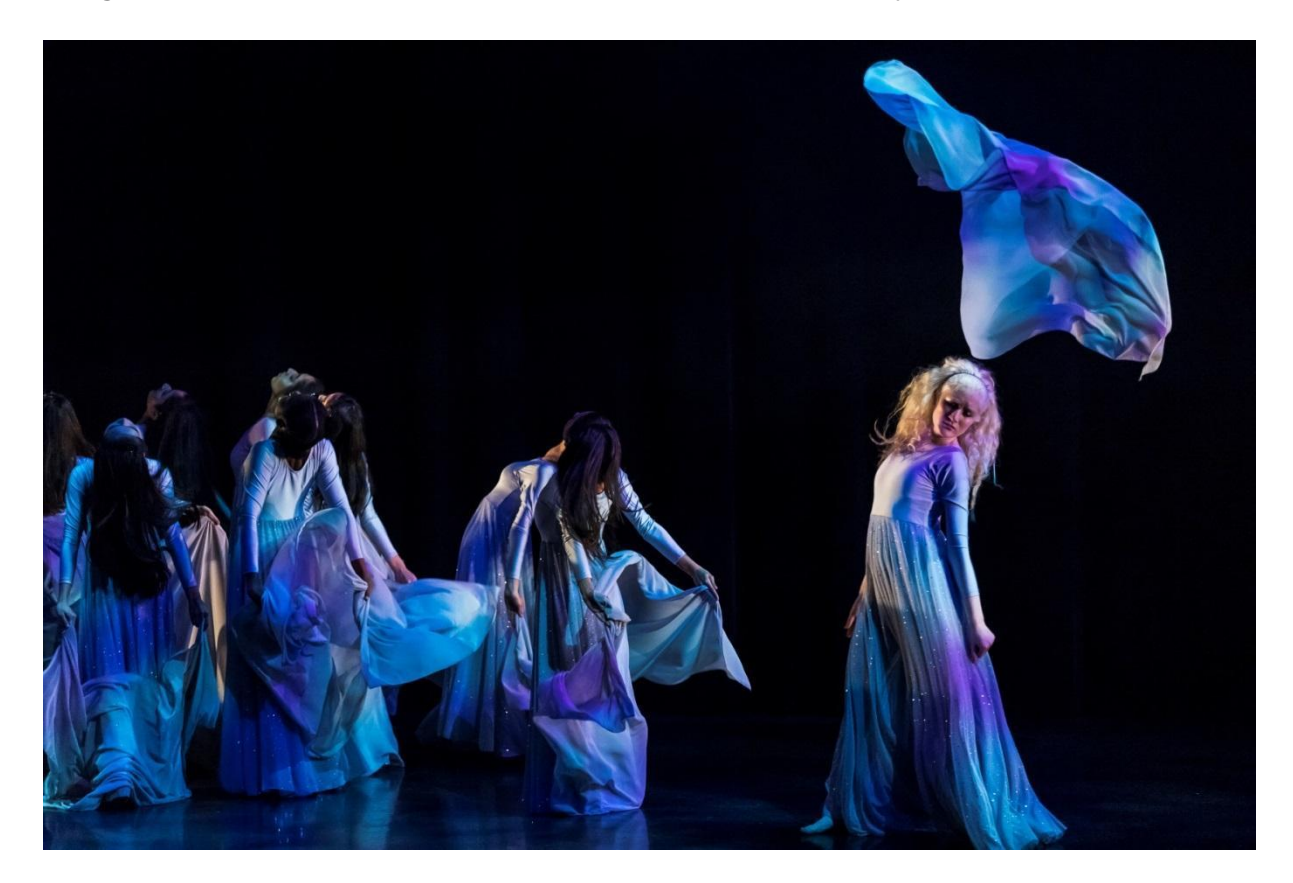
Refugee Dance Ensemble

During this rehearsal the audition panel recommendations will be integrated and the tutor will assist in completing the choreography. Further mentoring and professional dialogue will be established and continue towards the performance