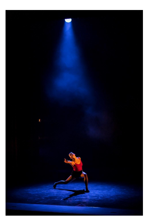
Newtown Performing Arts High School

ITSDF24 offers support to schools preparing for the festival and incorporates student workshops with dance industry professionals throughout the duration of the production weeks. The festival committee are proud to present the talents of our students and teachers; the dancers and choreographers from our public schools NSW.